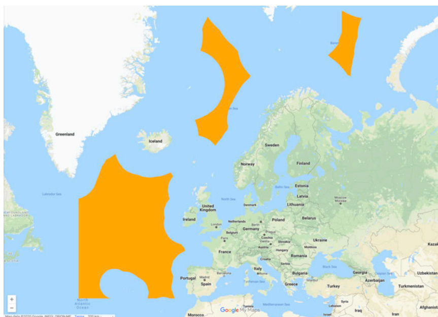
Map 2: Areas regulated by the NEAFC Convention – source: website neafc.org. The Loophole, one of three NEAFC areas, is the diamond-shaped space immediately above and west of the Russian Federation, north east of continental Norway and south east of Svalbard.